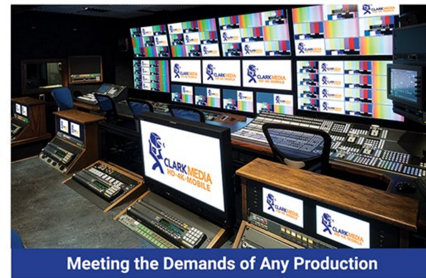
Meeting the Demands of Any Production

When your setup requires computers, encoders, converters, and other innovative equipment, we have space for that. Rack spaces with tie lines, flexible counter spaces that accommodate keyboards, monitors and support gear. Our configuration affords you all the comforts of a big studio space... on wheels.